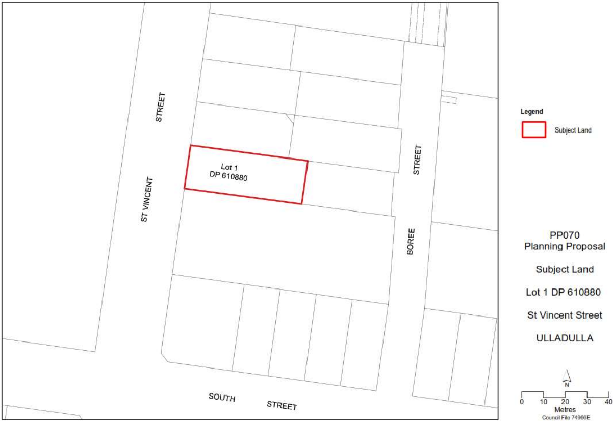
Figure 2: Subject Land