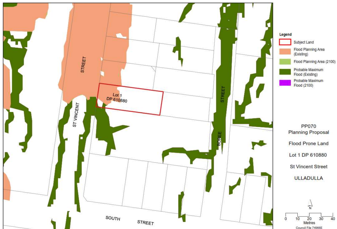
Figure 5: Flood Prone Land

Furthermore, the subject site is only mapped as being partially flood affected in the Probable Maximum Flood (PMF) event to a relatively shallow depth, although likely a higher velocity due to the steepness of the road.