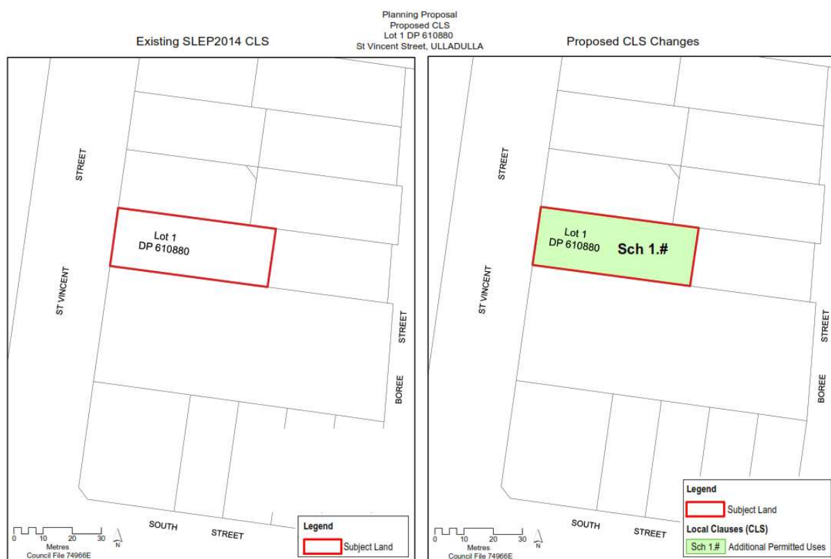
Figure 6: Existing and Proposed Shoalhaven LEP 2014 Clauses Map

The PP will result in an amendment to the Clauses Map (CLS_016D) of Shoalhaven LEP 2014 to identify the site as being subject to an Additional Permitted Use, Sch 1.#, as illustrated in Figure 6 .