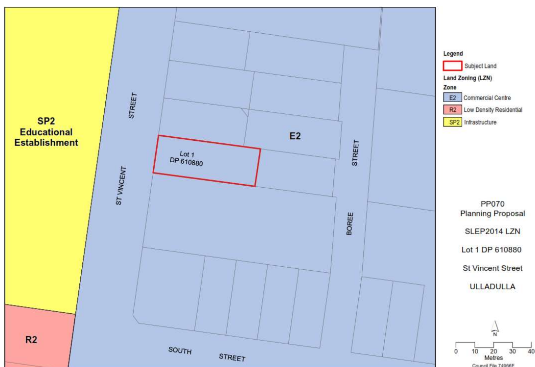
Figure 4: Current Land Use Zones

The subject site is currently zoned E2 Commercial Centre under Shoalhaven LEP 2014, depicted in Figure 4 , which does not permit the 'Group home (transitional)' land use. As such, the PP seeks to amend Shoalhaven LEP 2014 to allow the subject land to be used for the purposes of a 'Group home (transitional)' as an additional permitted use under Clause 2.5 of this plan, to facilitate the intended outcome.